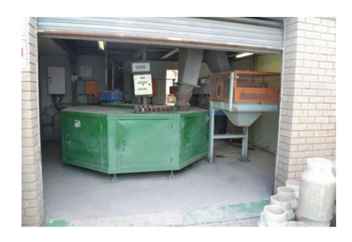
Figure 5-Indexed carousel used to collect samples crushed to 8 mm

The Journal of The Southern African Institute of Mining and Metallurgy