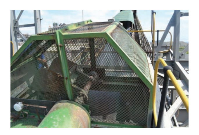
Figure 4–0.45 m cutter on 1.35 m belt for primary sample. The cutter sweeps an increment into the impact crushers

operate while a large rock was on the belt. To obviate this, large rock detector systems are in place to prevent the hammer from operating at that instant, and the sample action is slightly delayed.