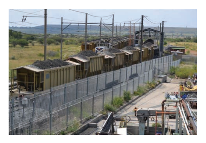
Figure 2-Span of hoppers en route from shaft to plant

A constant 5% moisture factor is used to correct wet mass to dry mass. This factor is checked periodically by sampling campaigns using a reverse function on the hammer sampler to collect a single increment for moisture measurement.