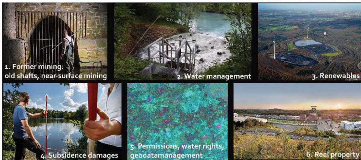
Figure 6—Burdens and perpetual tasks. (1–3 ©RAG; 4. ©THGA; 5. JERS data ©JAXA, SAR and InSAR processing by Gamma Remote Sensing AG, 1998; ©Brüggemann)

geothermal energy. This move towards alternative energy sources brought about a boost of creativity and innovation that also captured post-mining areas, because former mining areas offer many opportunities to generate renewable energy.