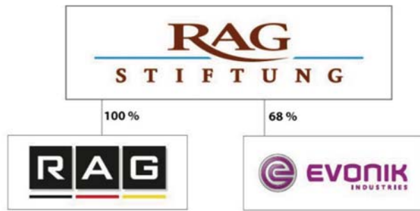
Figure 2—Company structure of the RAG-Stiftung/RAG (RAG-Stiftung, 2015)

RAG and 68% of the shares of Evonik Industries. The foundation has to ensure that the proceeds from the profitable business units will be used to provide sustainable funding for post-mining tasks so that German taxpayers will not have to pay for them. In addition, the RAG-Stiftung has the responsibility for promotion and support of education, sciences, and culture in the mining regions (RAG-Stiftung 2017).