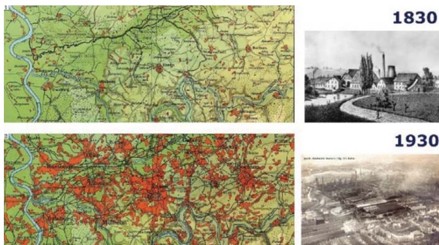
Figure 1—The Ruhr, one of the biggest industrial agglomerations in Europe, was built on coal

The German government has passed a law on funding the termination of hard-coal mining. Based on this law, the 'old' RAG was split into three parts (Figure 2): a newly set up foundation, the RAG-Stiftung (RAG-foundation); the subsidized coal mining unit plus coal trade, land management, site development, and a few other coal-related service companies, still named ('new') RAG; and profitable business units, mainly the subsidiary Evonik Industries, one of the world's leading specialty chemicals companies, beside other interests. RAG-Stiftung holds 100% of the shares of