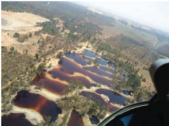
Figure 8—Collapse pits filled with acid minewater

From the perspective of risk management, the severity of contamination will rise and the post-mining costs will increase in the future. There is therefore a need to restore the areas disturbed by sinkholes and secure other abandoned mining areas against sinkholes and subsidence. The Council for Geoscience wants to proof the near-surface rooms of abandoned hard coal mines against filling. Therefore a suspension should be used that is able to fill the rooms