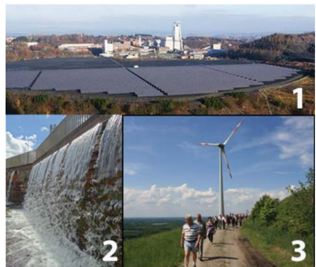
Figure 7—Creating renewable energy, an opportunity of post-mining. (1) Photovoltaic plant on a mud pond; (2) heat from minewater; (3) wind turbine on a dump

With room and pillar mining there is a high risk of failure of the supporting pillars or the roof. The estimated six million pillars will fail over time, and most of the 1600 km 2 area will be disturbed. This poses a latent risk for every kind of surface usage like housing, roads, or farming. Additional