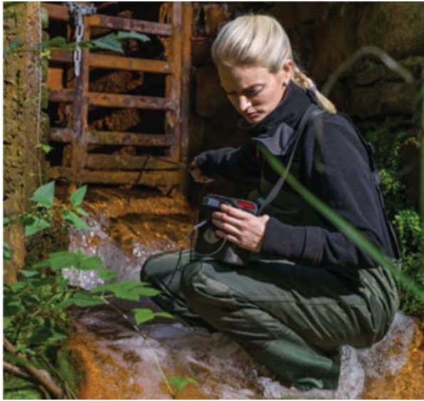
Figure 10—Researcher from TH Georg Agricola University examining minewater from an old adit (TH Georg Agricola, 2017)