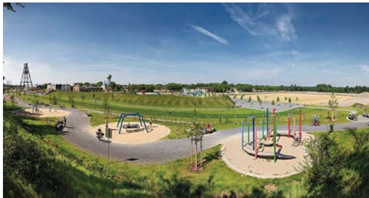
Figure 4—Kreativ.Quartier Lohberg. Overview of the former industrial centre that is being transformed into the first CO 2 -neutral suburb in Germany (Steinkohle, 2016. Photo by Dietmar Klingenburg)