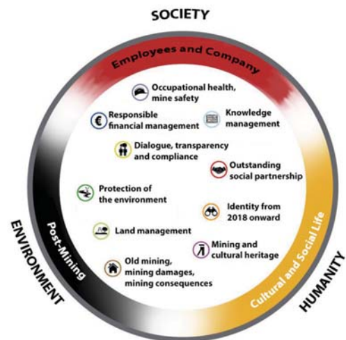
Figure 3—Ten spheres of activity in the sustainable development strategy of RAG (RAG 2015)