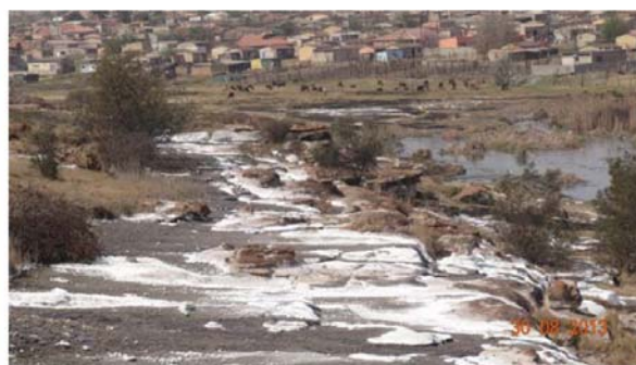
Figure 9—Decant of AMD (acid mine drainage) from the abandoned Transvaal and Delagoa Bay Colliery close to eMalaheni in Mpumalanga. (Right) at the end of dry season and (left) at the end of rainy season